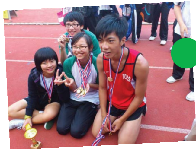
Our hard work paid off in the end!