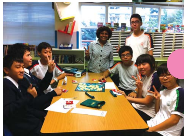
V for Victory! Scrabble's a great Scramble!