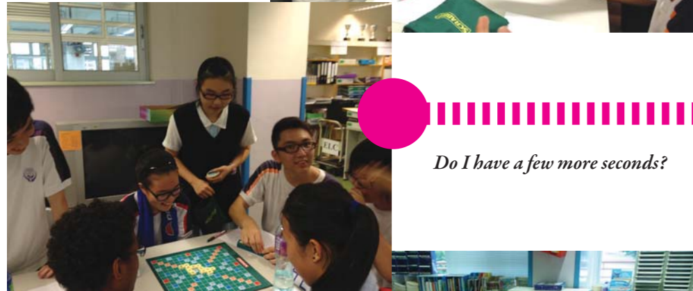
Do I have a few more seconds?