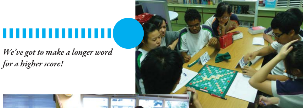
We've got to make a longer word for a higher score!