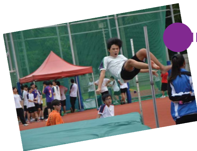
Ohh! Did I clear the bar?