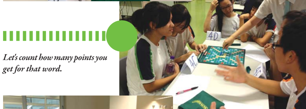
Let's count how many points you get for that word.