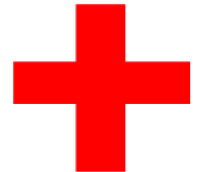
▲ Hong Kong Red Cross

On 2nd February, the first Blood Donation Day of 2011-2012 was held in the school hall. Many students and teachers joined it enthusiastically as before. Their purposes were the same - to save lives by donating blood.