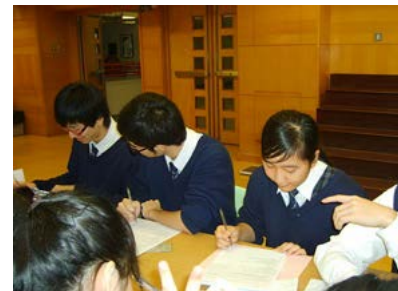
▲ Students filled in the donor form.

Before donating blood, donors needed to fill in the donor form to update donor's personal data and to make sure they were healthy. Also, the details could enable the nurse to properly classify and separate the different types of blood. Next, they had to have their fingers pricked for a haemoglobin test to ensure that their blood iron content met the criteria for ability to donate. Then, the donation lasted about 7-10 minutes and 300 mls to 450 mls of blood was taken from each donor. After donation, donors can then enjoy the drinks and snacks offered