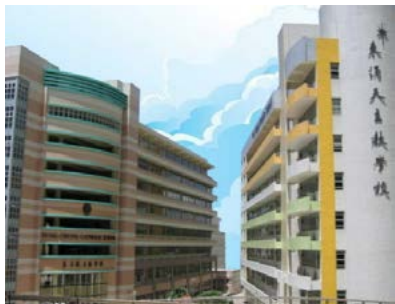
■ A big day for TCCS.

Although there were some setbacks for some students, most of the students looked forward to striving for a good academic result this new school year.