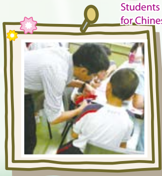
An English teacher helping students with the activity in the ELC