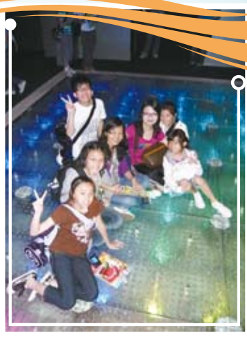
We visited the NeWater Visitor Centre. Can you see recycled water?