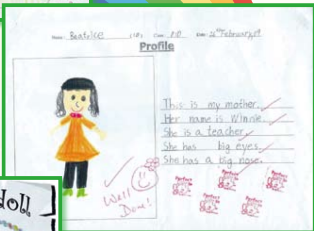
Profile P.1D Beatrice