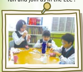
Be my valentine! Students are making bees for our Valentine's Day activity

The ELC is a safe and comfortable space for students to use and build their English skills. Every Wednesday, students can enjoy planned activities in English such as crafts and games. Available daily are computer stations, power worksheets, a movie platform, various storybooks for different levels and games in the ELC. Teachers, assistants and English guides are able to support and facilitate students and their needs. Come have fun and join us in the ELC !