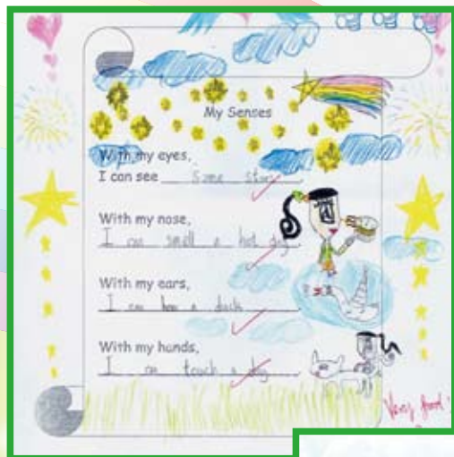
My Senses P.1A Moki Ka Ki