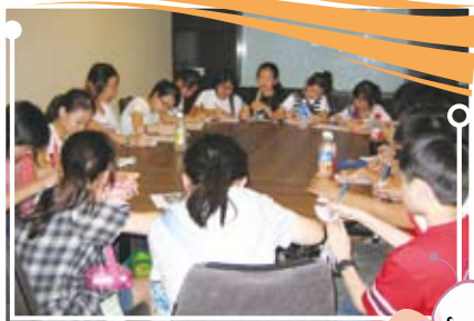
Diligent students were working hard on their project.

To arouse students' interest in learning English and build up their confidence in communicating with others in English, a four-day Singapore English Learning Tour was organized during the Easter holiday. The trip has enriched their learning experience and broadened their horizon.