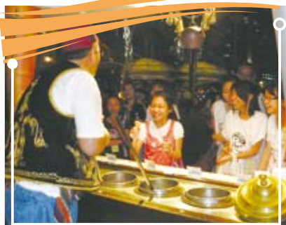
Please give me my delicious ice cream!