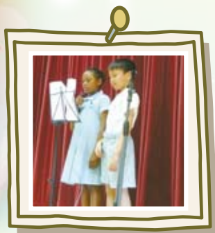
Brilliant English Guides as MCs for the Drama Competition