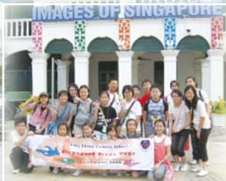
We had fun on Sentosa Island.