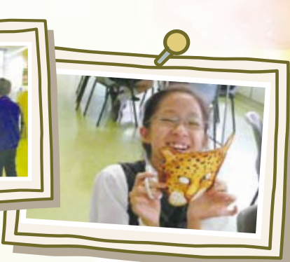
Students making animal masks for our masquerade party