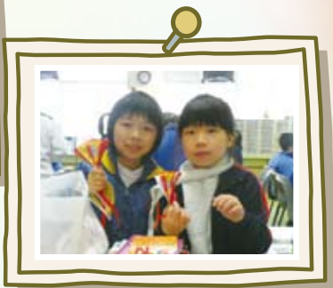
Students made a beautiful red fan for Chinese New Year celebrations