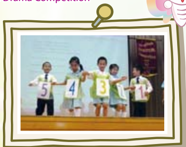
Primary One students performing "One Teddy All Alone" in our Drama Competition