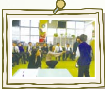
Games in the ELC