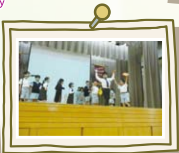
Primary Two students performing "The Hungry Giant"