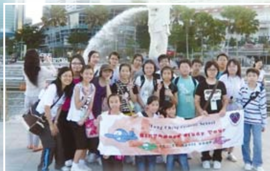
Do you know where we were? There was a big merlion behind us!