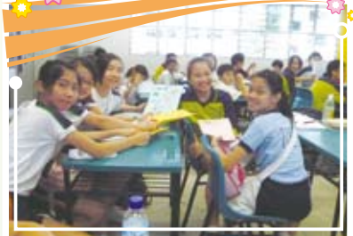
We made many friends at Zhangde Primary School.